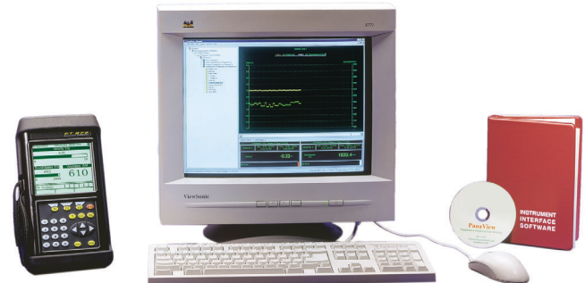
PanaView software links your TransPort flowmeter to your PC.

Infrared adapter plugs into any available serial port to give desktop PCs infrared capability.