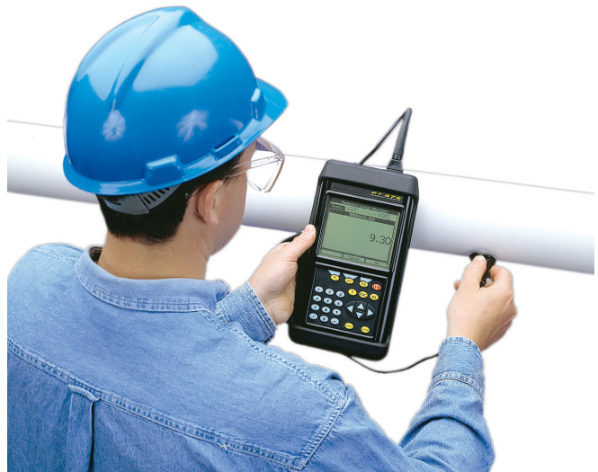
PT878 thickness-gauge option

Continuous operation to 100°F (37°C); intermittent operation to 500°F (260°C) for 10 sec followed by 2 min air cooling