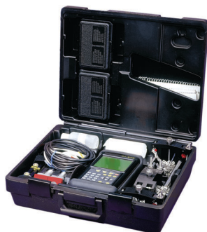
The complete TransPort PT878 flowmeter system fits in a compact carrying case.

When you need a permanent record of your work, live measurements, logged data and site parameters can be sent to a variety of printers by beaming data directly from the TransPort PT878's infrared port. A compact, lightweight, hand-held, infrared thermal printer is available. This printer is powered by a lithium ion battery.